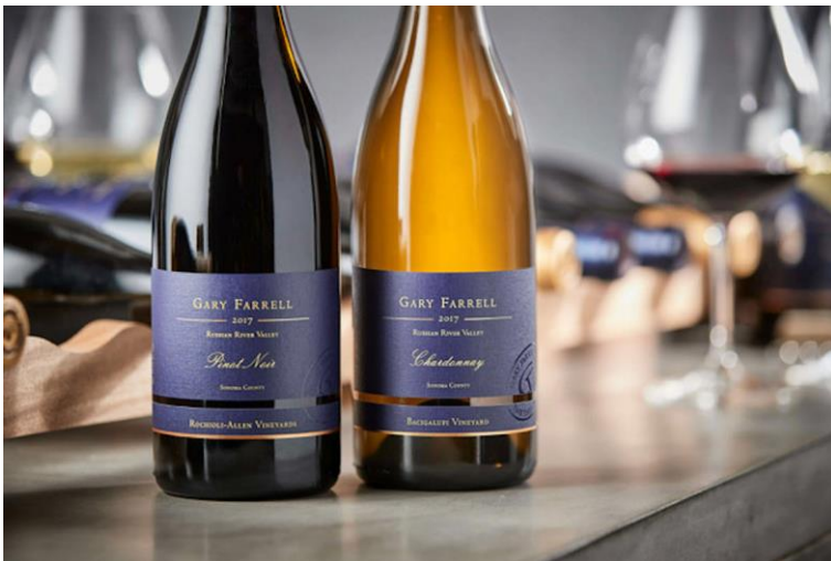
Gary Farrell 2017 pinot noir and chardonnay are substantive and balanced. (Courtesy photo)

The Hallberg Vineyard, located in the Green Valley sub-appellation, north of Sebastopol, is closest to the ocean and marine influences. Sandy loam soils allow for deep root penetration that produces pinot noir with earthy characteristics.